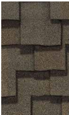
Solaris Autumn Blend CRRC Product ID 0668-0127