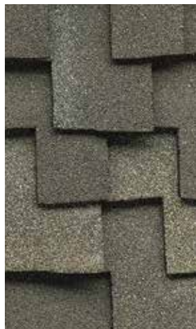
Solaris Country Gray CRR Product ID 0668-0128