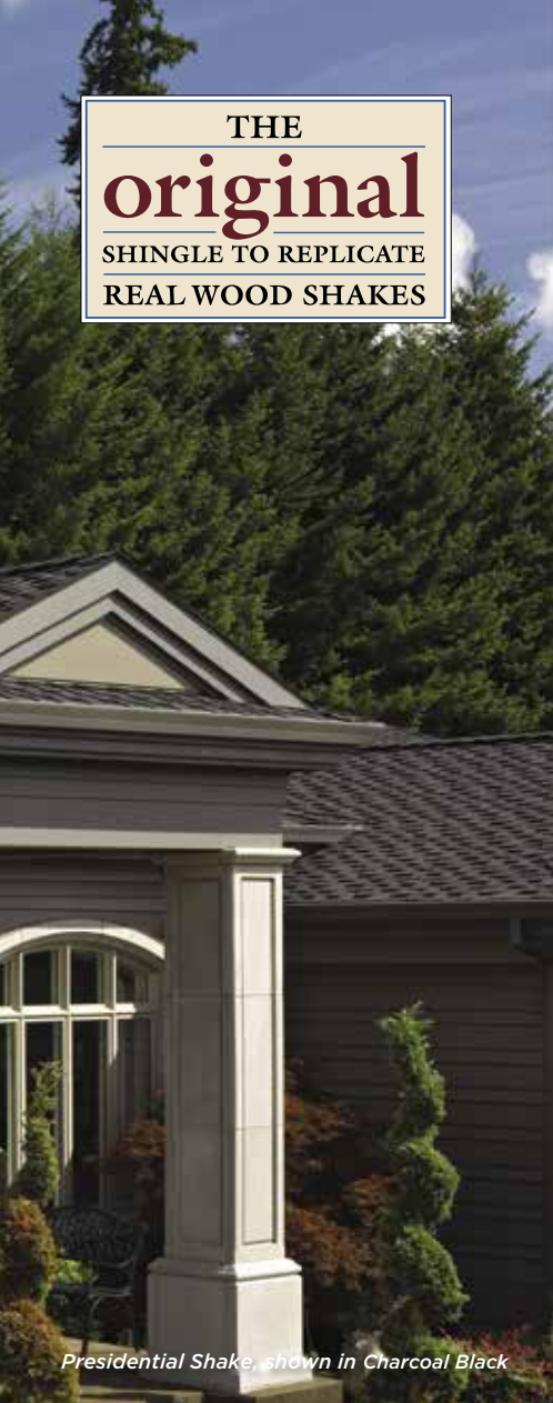
Presidential Shake, shown in Charcoal Black

THE original SHINGLE TO REPLICATE REAL WOOD SHAKES