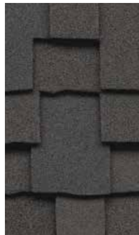
Solaris Shadow Gray CRR Product ID 0668-0134