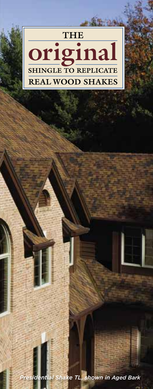
Presidential Shake TL, shown in Aged Bark

THE original SHINGLE TO REPLICATE REAL WOOD SHAKES