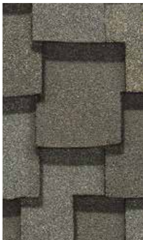
Solaris Country Gray CRRC Product ID 0668-0128