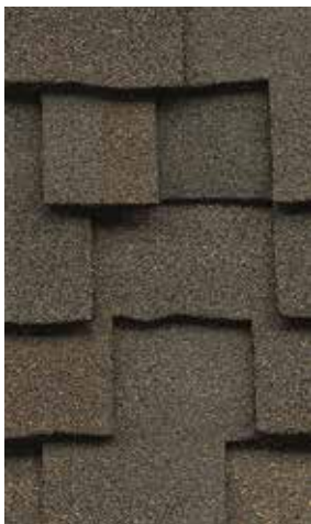
Solaris Autumn Blend CRR Product ID 0668-0127