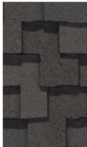
Solaris Shadow Gray CRRC Product ID 0668-0134