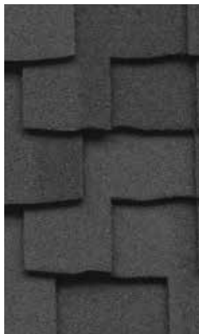
Solaris Charcoal Black CRR Product ID 0668-0132