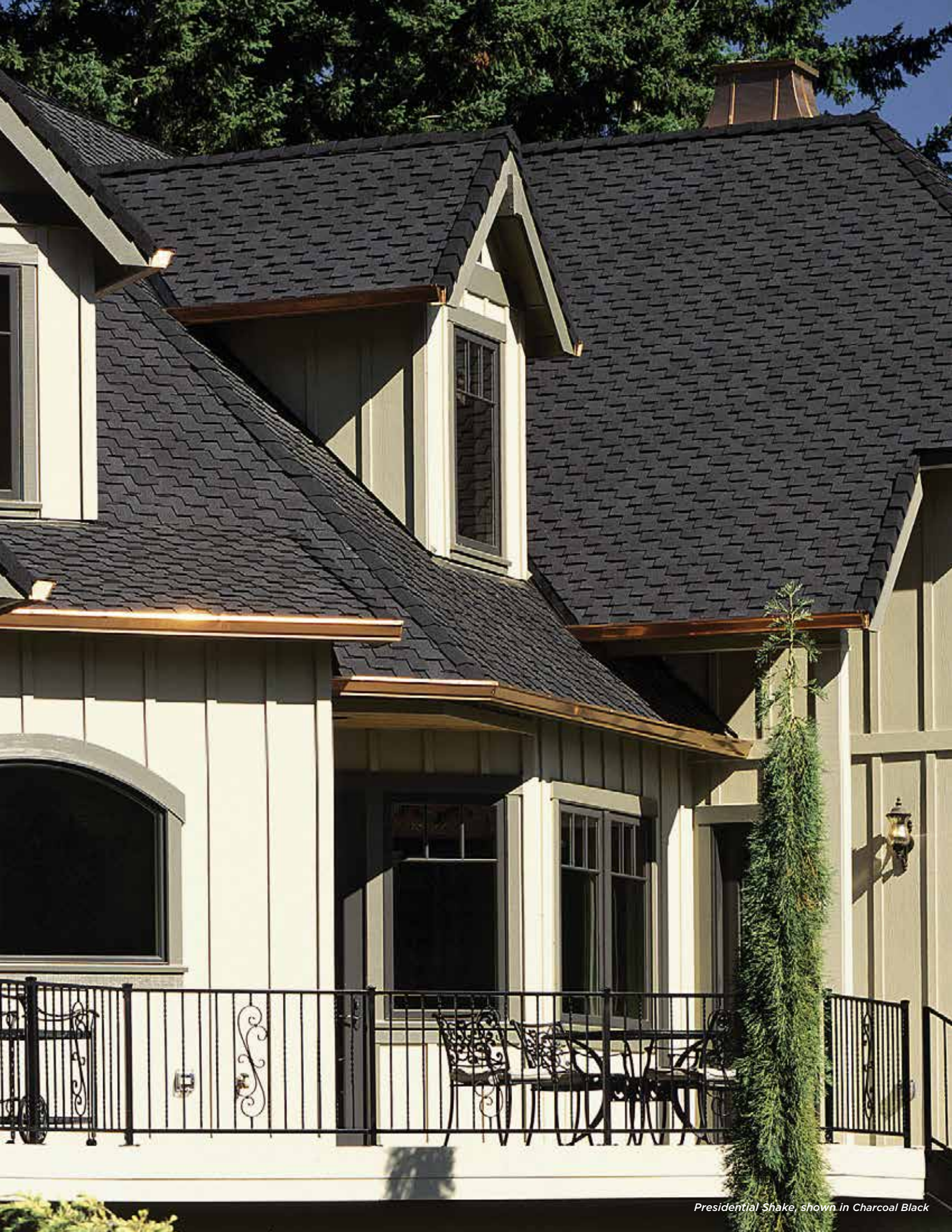
Presidential Shake, shown in Charcoal Black